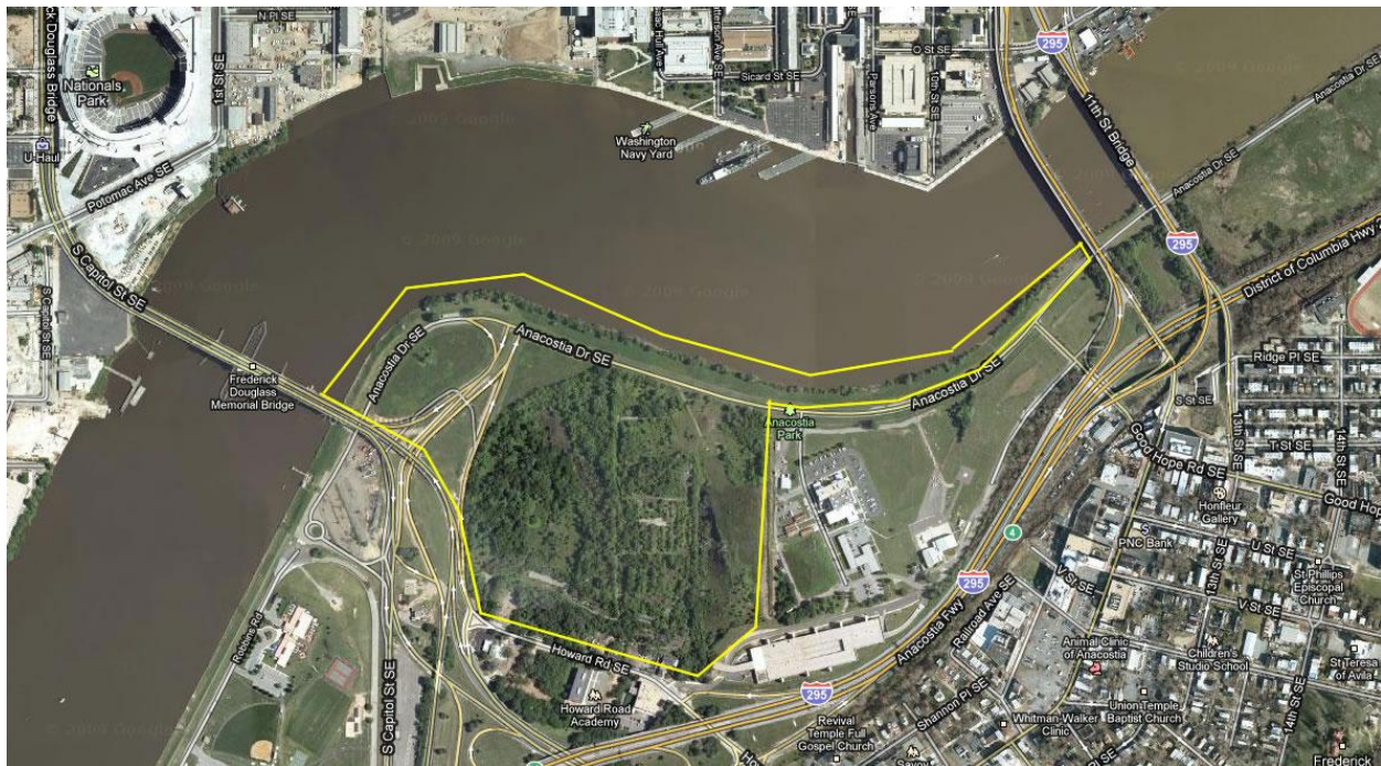
Picture 2. The yellow area indicates the Stage A of current consideration in the proposal

As we are committed to children, our endeavors focus on creative opportunities for them. Thus, by this proposal the following will be built: a skating rink, music school, Battleship Museum, Anthropology of Art & Natural Curiosity Museum, an Exhibition & Convention Center, children’s puppetry, circus, cinemas and theater. A Live Space Exploration Center, Children's TV Station, Children's Film Studio, a Technical Science & Applied Creativity Center, Children's Publishing House, playgrounds, and a kids’ café will provide entertainment and extra learning opportunities.