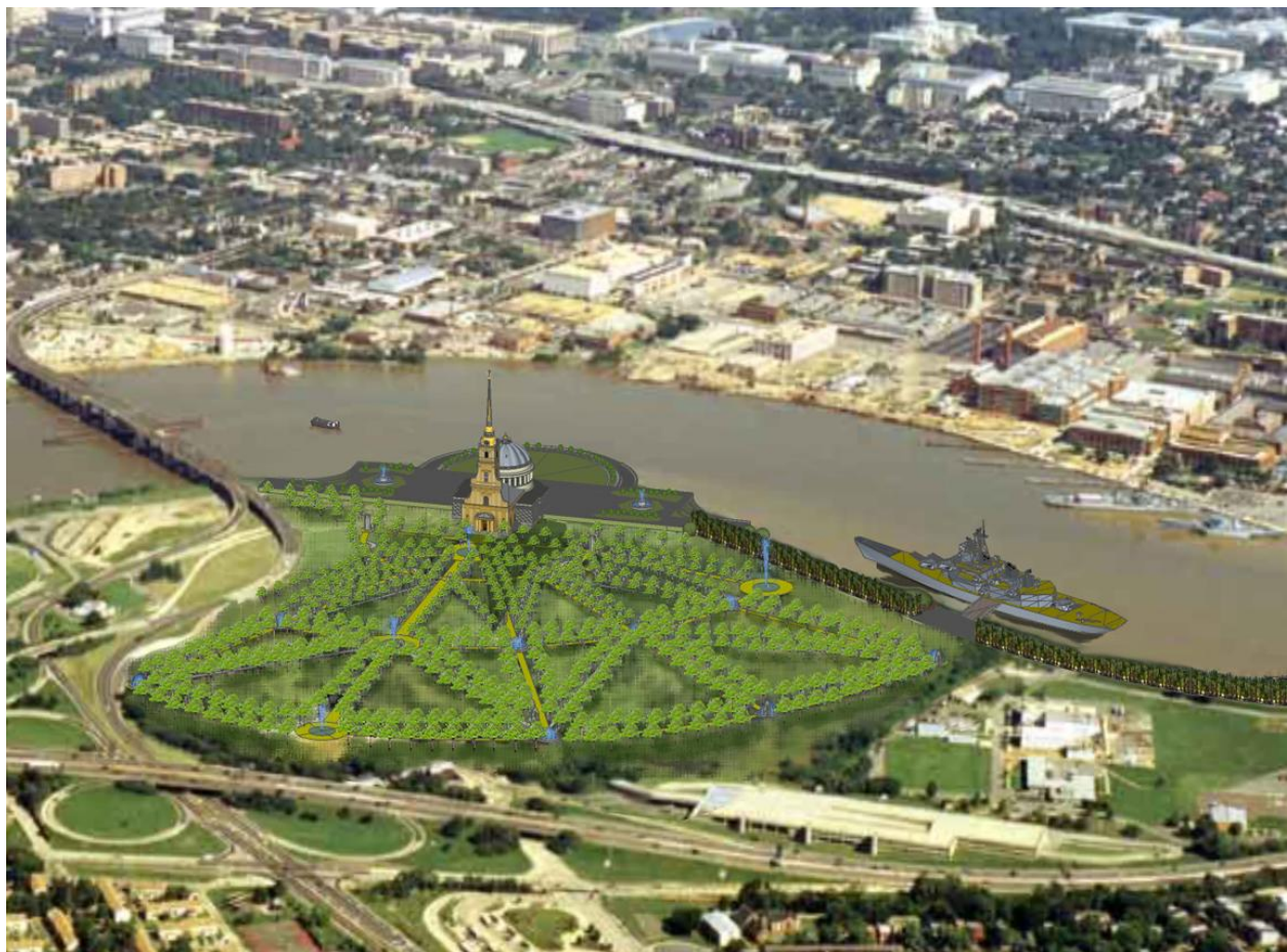
Picture 4. A bird’s eye view from a southeast vantage point; general model